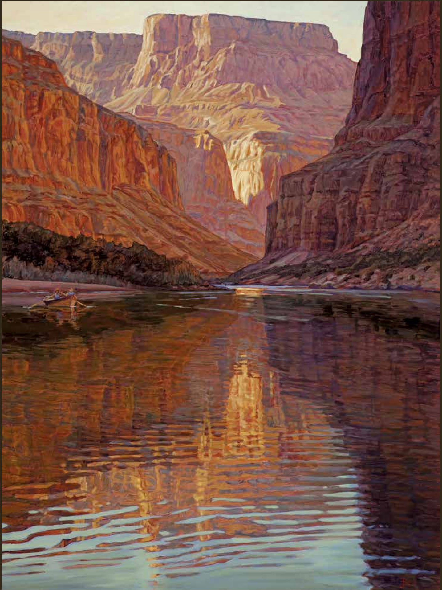
Elizabeth Black November Morning Below Nankoweap, Mile 53 Oil on Panel | 30 x 40 inches | 2011