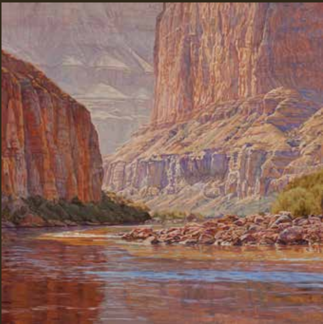
Elizabeth Black, Downstream from Saddle Canyon, Mile 47, On the Grand Oil on Panel | 30 x 30 inches | 2012