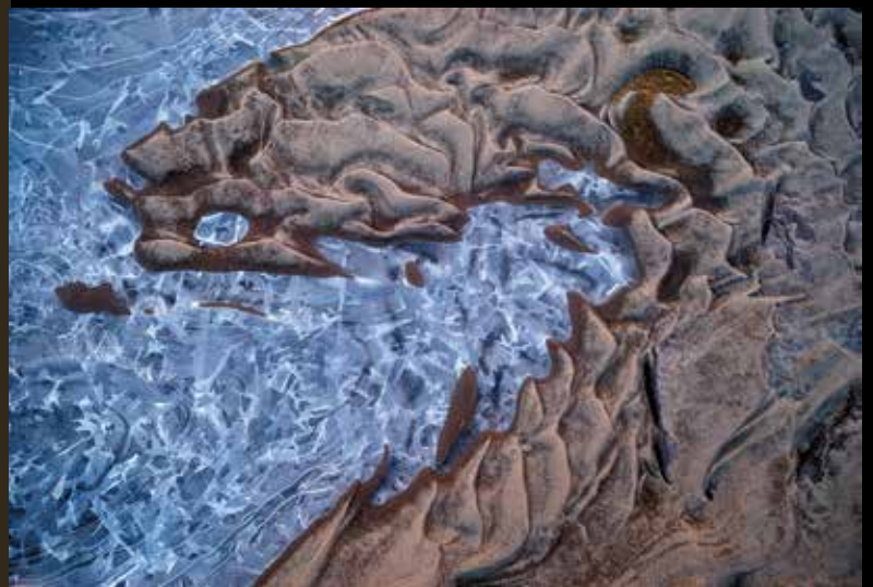
Chris Brown Ice and Frozen Sand, Utah

Falling in love with each other was a natural extension of the passion they both feel for adventure, exploration and the outdoors — that both are also artists was a stroke of serendipity.